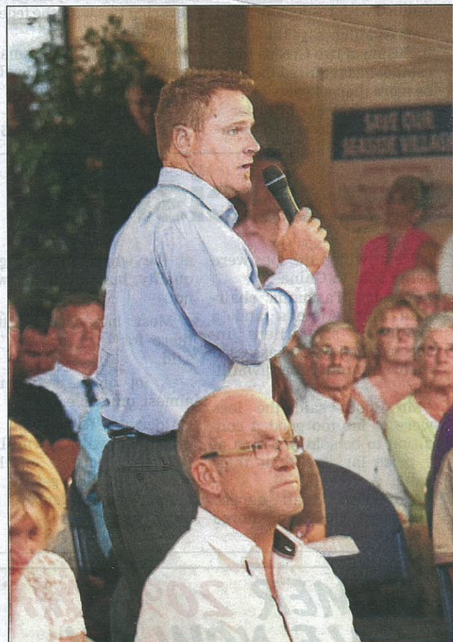
Senator Peter Whish-Wilson puts his view on the proposed Shearwater developments at Wednesday night's meeting.