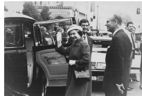
1988 Royal couple leave Launceston