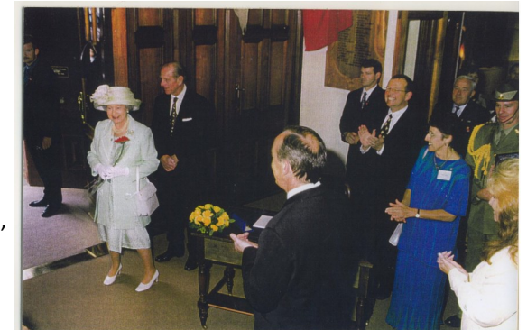
2000 HM and Duke of Edinburgh at the Maritime Museum which HM opened in the Carnegie Building, Argyle Street, Hobart