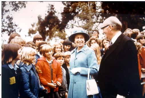
1977 HM with Sir Stanley Burbury, Governor of Tasmania