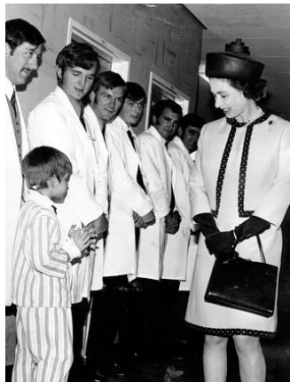
1970 HM visit to the Children's Ward RHH