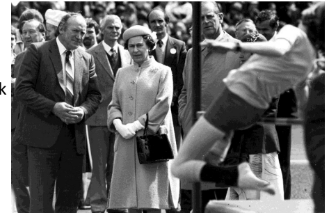
1981 Visit to the Domain Athletics Centre speaking with Darrel Baldock Minister for Recreation