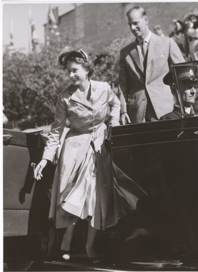
1954 HM and Duke of Edinburgh in Hobart